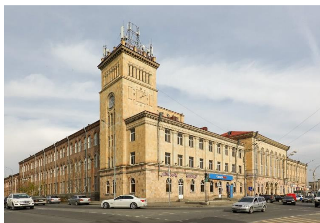
Figure 8 "Chulochni"-stocking factory in Gyumri.