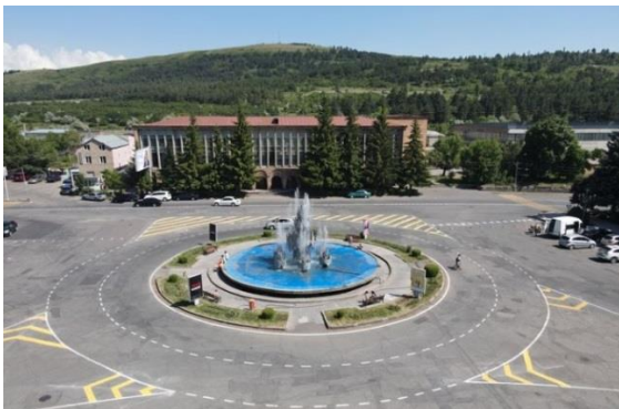
Figure 2 Functional structure of urban fabric-central square as a focal point of composition.

With the loss of the mentioned main function, at the same time, the development of other, new areas of activity with the need for sustenance naturally dictates the reorganization of the areas that have exhausted the function and the infrastructure related to it. Even the number of the population, which was unnaturally increased due to the environment dictated by the previous function, is also subject to review; therefore, the settlement acquires its optimal dimensions and the need for new infrastructures corresponding to the newly assigned functions (resource extraction, IT, creative technologies) (Figures 3, 4).