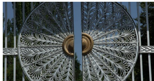
Figure 5 Fragment of the entry gate of the factory in Charentsavan.