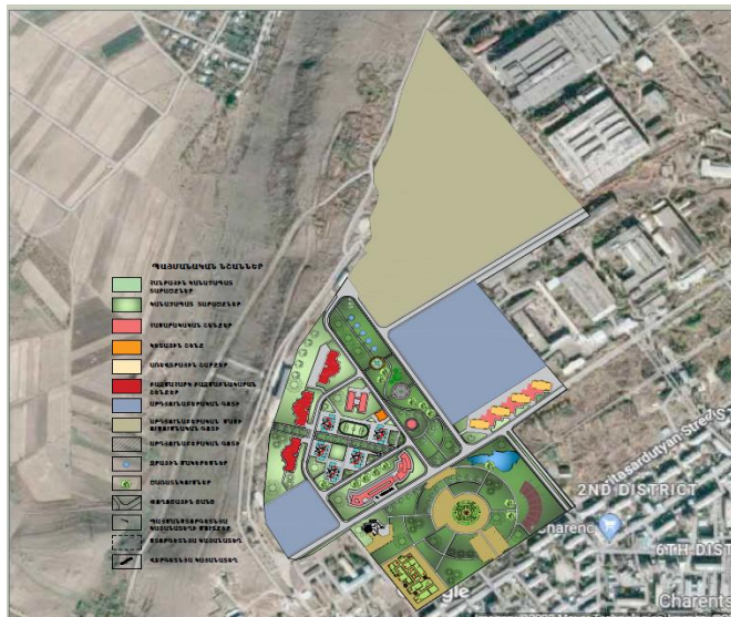
Figure 7 Adaptive reuse of the industrial cluster in Charentsavan.