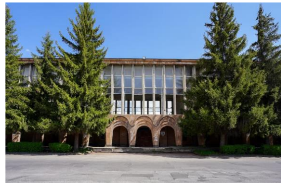
Figure 3 Abandoned train station in Charentsavan.