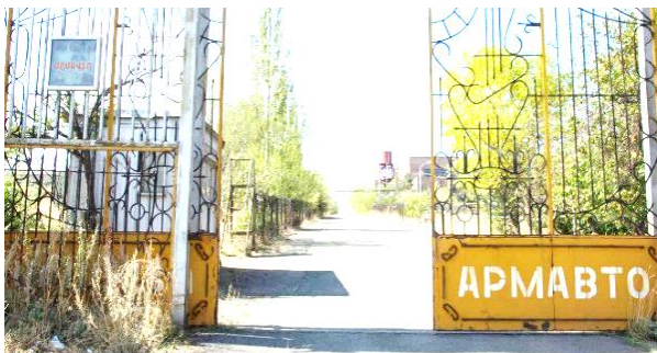
Figure 4 Fragment of the entry gate of the factory in Charentsavan.

It is also important to mention that the aesthetic component was obligatory even for industrial buildings, given its historical or architectural significance, including just buildings or subsidiary parts such as fences and gates (Figure 5).