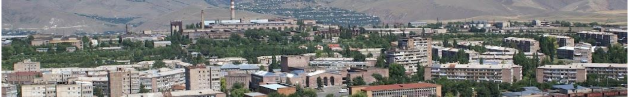
Figure 1 Main view of city Charentsavan.

An almost identical situation was created in almost all post-Soviet republics (Amiraghyan, 2007): as a result of the collapse of a single "mechanism", its individual elements lost their viability due to the inability to act separately, the privatization of state property of industrial zones and the elimination of the consumption market (The master plan of Charentsavan city, 2007; Manufacturing, 2022).